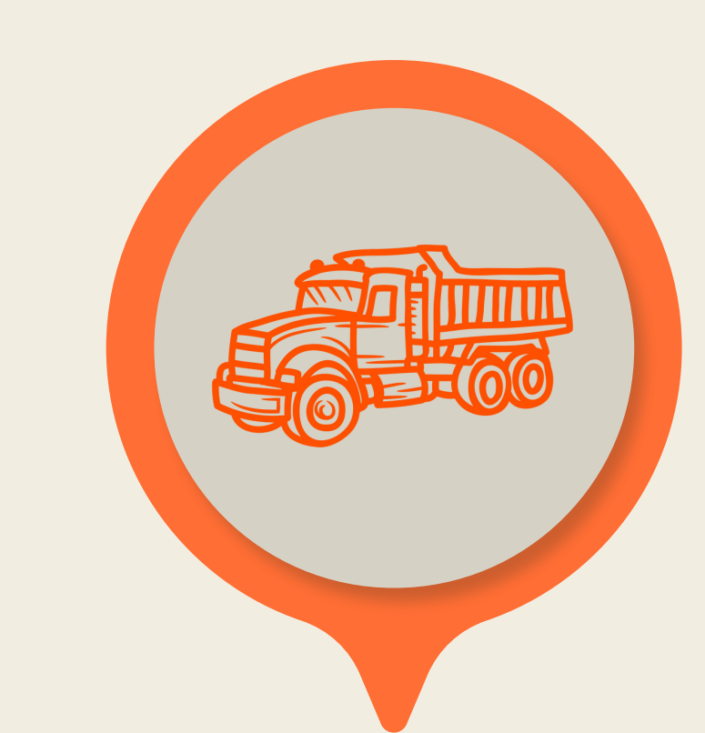
23.4 K Hauling Companies