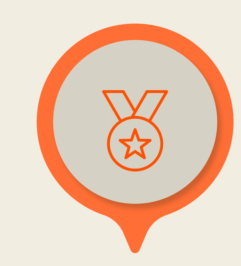
30 Haulers taking 1st shift