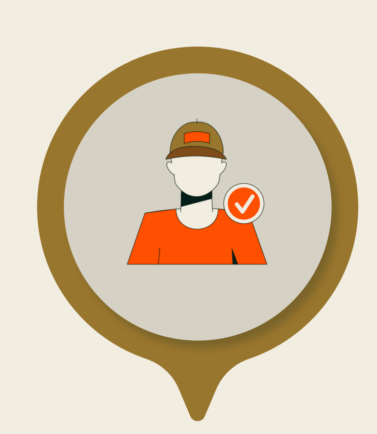
58.4 K Verified Haulers

Trux eclipsed a milestone in 2023, blowing by the 50,000 verified hauler mark in the first half of the year.