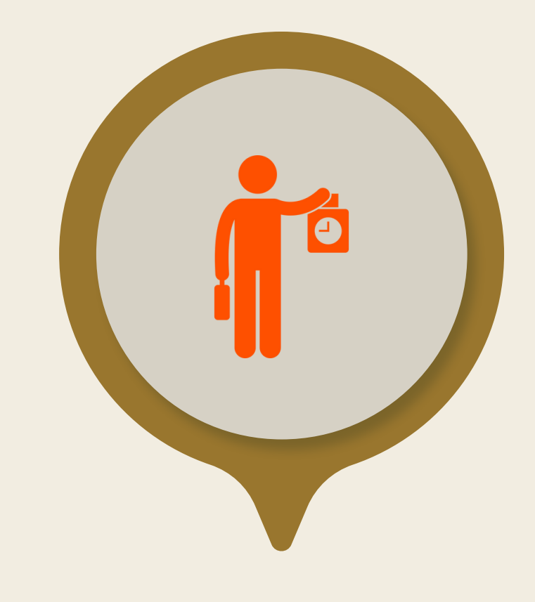
4.6 M Hours Worked

Haulers put in a lot of hours, and a record number took their first shift ever on the Trux platform each day!